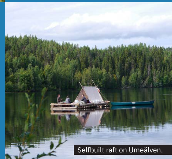
Selfbuilt raft on Umeälven.