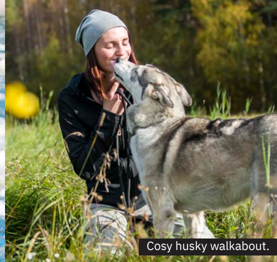
Cosy husky walkabout.

Find a new favorite splash among lake, sea or indoor baths. More information can be found at: visitumea.se/en/summer