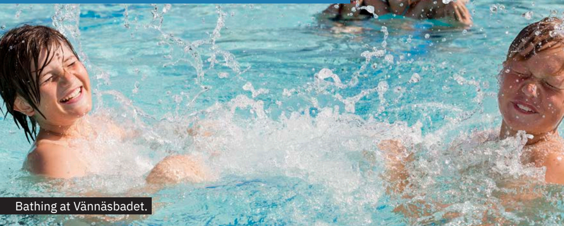
Bathing at Vännäsbadet.

Around Lake Tavelsjö , around Lake Nydala and along Ume Älvdal shore path are some examples of popular and easily accessible trails that are well suited for both bicycle trips and easier hiking. Learn more at: visitumea.se