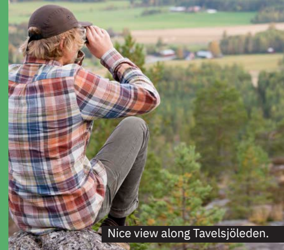
Nice view along Tavelsjöleden.

Tio Toppar, Tavelsjö is a visitor guide that helps you find your way up ten mountains. The mountains offer different experiences, levels of difficulty and views. For each mountain there is a marked path from its base up to the top. Choose between walks from 0.5 to 2.1 km (one way) and slopes that vary between 46 and 165 meters. After climbing all the mountains you will have climbed a total of 1000 meters.