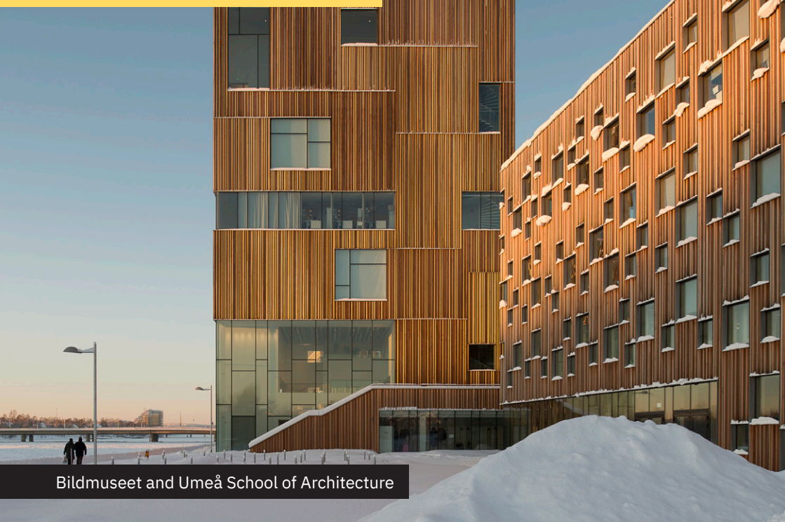
Bildmuseet and Umeå School of Architecture