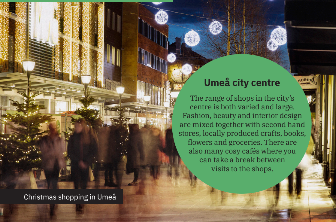
Christmas shopping in Umeå